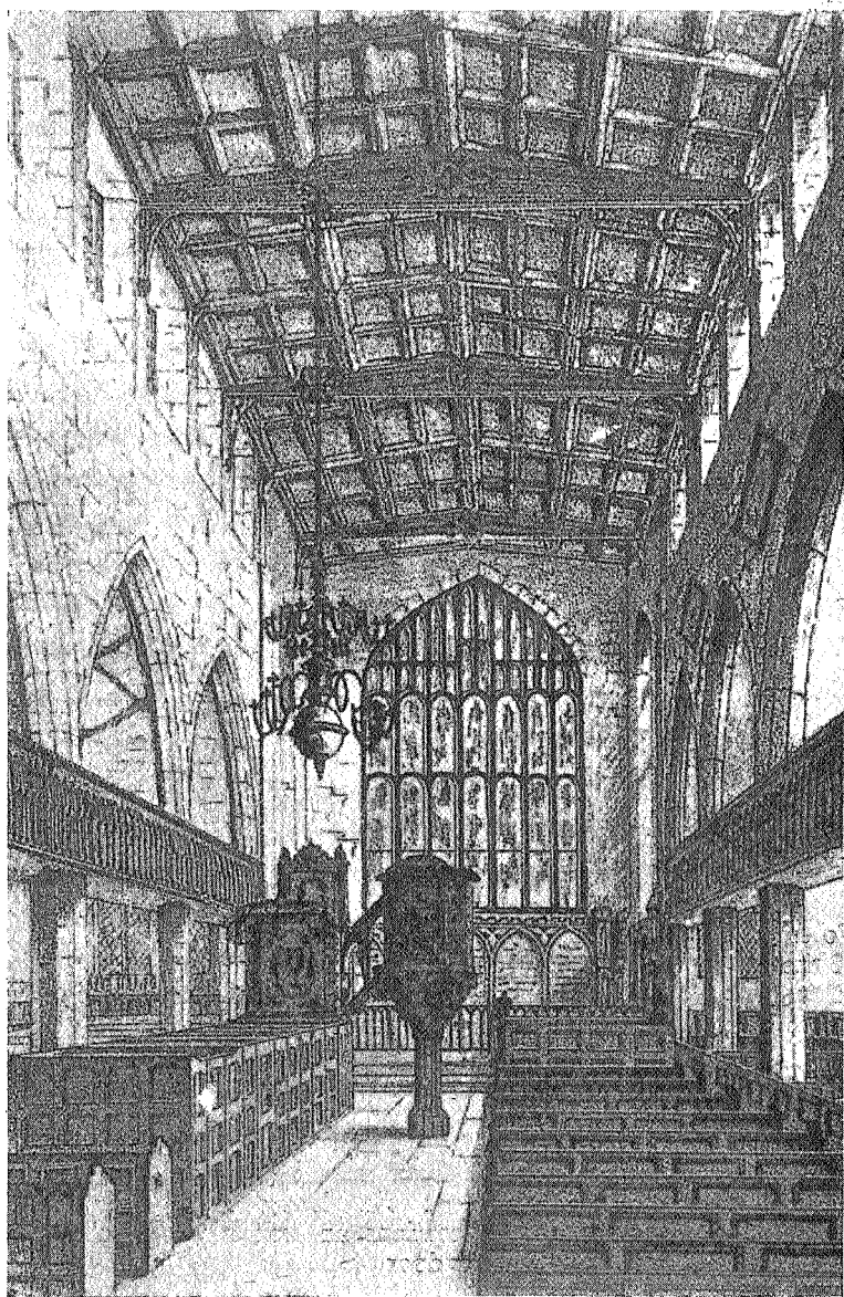
Reproduction from an Etching dated 1850