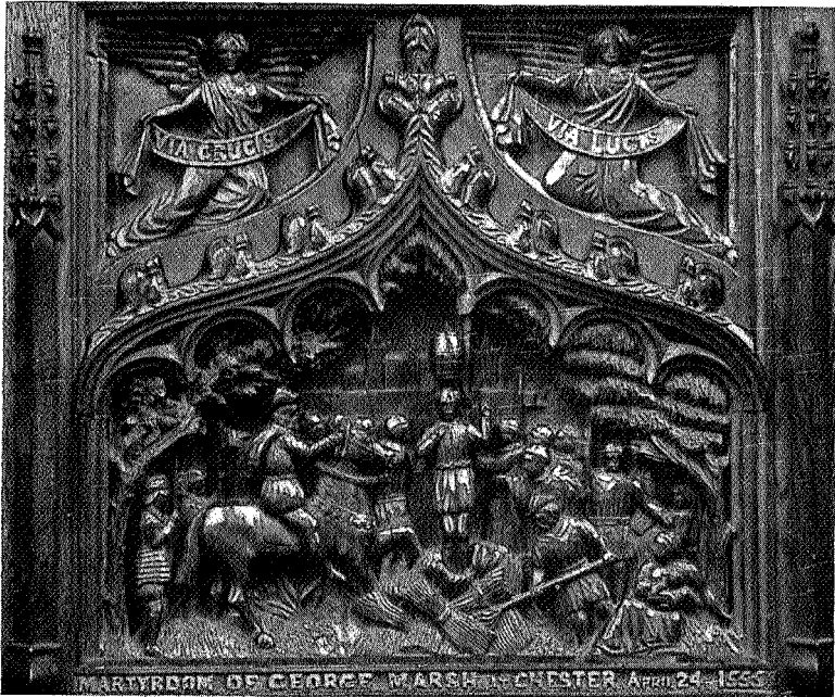
Altar Carving—The Martyrdom of George Marsh

The altar at Deane is unique. The frontal is of carved oak, the centre panel depicting " The Martyrdom of George Marsh, at Chester April 24th, 1555 " . . . . . the scene being adapted