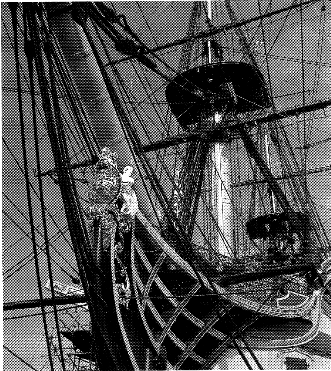
'A fine head' - Nelson's 'Victory', Portsmouth, (Y series cover published by Chansitor Publications Ltd, 16 Blyburgate, Beccles, Suffolk, NR34 9TB; printed in Great Britain by Stott Brothers Ltd, Halifax and Oxford)

8.00am Communion 10.30am Family Service 6.30pm Family Communion